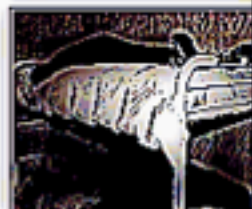
HEAVENS GATE MASS SUICIDE

DEL MAR, California (CNN) -- The 39 cult members found dead in a hilltop mansion apparently died in a carefully orchestrated suicide that involved sedatives, vodka and plastic bags possibly used to suffocate, officials said Thursday.